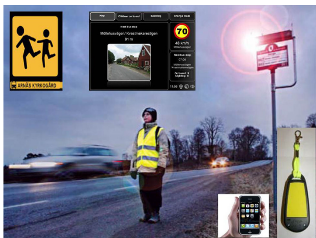
Fig 2 The SAFEWAY2SCHOOL system. The relevant parts for the present study were the flashing “Intelligent bus stop”, the radio transmitter that the children carry as their “bus ticket”, the special yellow signage on the school buses (similar in the video but not identical), the mobile phone which can receive live SMS updates, and the “On-board computer” carrying all the relevant information about every child boarding and alighting the bus

The remaining questionnaire, background information and eye tracking data were analysed using Mann–Whitney U-tests for group comparisons and \chi^2 -tests/Fisher’s exact tests to analyse categorical data. In all analyses, the \alpha -level was set to .05, with the level adjusted by Bonferroni correction where applicable. To estimate the clinical relevance of the findings, Cohen’s effect size (Cohen’s d ) [18] was used for parametric outcomes (large effect \geq 0.8 ) and r [19] for non-parametric outcomes (large effect \geq 0.5 ). Based on the 14 participants in the smaller group (CWD), a power of 80 % ( \beta=0.2 ) was provided by the sample size to detect a standardised difference (Cohen’s d ) between the CWD and the Con groups of 1.3 given the \alpha -value of .05.