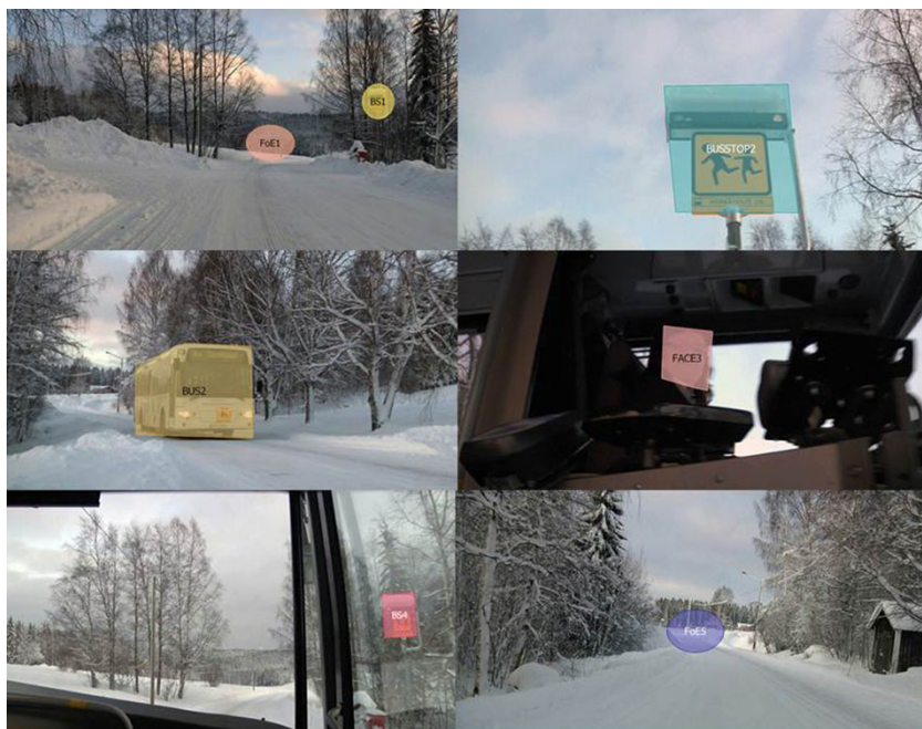
Fig. 1 The five video scenarios (scenario 2, Wait at the bus stop, is represented by the upper right hand slide and the middle left hand slide ) and their relevant areas of interest (AOIs)

Data were analysed using SPSS 20 (SPSS Inc.). The Kolmogorov–Smirnov test was used to test the data for normal distribution, which was only found for the responses to the 50 statements in relation to the five scenarios and regarding the participants' age. These data were analysed with independent samples t-tests.