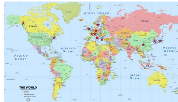
Fig 1: In IEA EBC Annex 65, 32 case studies in 12 countries on 3 continents have been scrutinized.

service life estimation. The case studies are distributed in 12 countries on 3 continents with various climate conditions and building traditions, see Fig.1. For certain conclusions to be drawn from the case studies, monitoring is essential. Unfortunately, monitoring and follow up is only performed in few of the case studies.