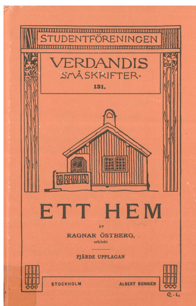
Figure 9. Ragnar Östberg (1866–1945): Ett Hem ('A Home'), Stockholm, Albert Bonniers Förlag, 1906, cover.

In Sweden Ragnar Östberg (1866–1945), one of the country's leading architects, was among those to take up the ideas of Ellen Key and Carl Larsson. In 1906 he published his own booklet with the title Ett Hem ('A Home'), an introduction to the building and furnishing of artistically designed country cottages (Östberg 1906; cf. Sheffield 1997, pp. 41–43) (Figure 9). They also influenced, for instance, the Skønvirke movement in Denmark, which arose at the beginning of the 20th century around Caspar Leuning Borch (1853–1910), Anton Rosen (1859–1928) and P.V. [Peder Vilhelm] Jensen Klint (1853–1930), which was situated between Art Nouveau and National Romanticism and became institutionalised in 1914 with the publication of a periodical with the same title. Finally, Ellen Key and Carl Larsson communicated extensively with the national romantic circle of the polar explorer Fridtjof Nansen (1861–1930), the painter Gerhard Munthe (1849–1929) and the young architect Arnstein Arneberg (1882–1961) in Lysaker in Norway (Lane 2000, pp. 79–89).