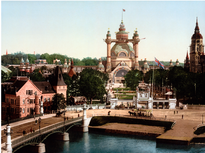
Figure 2. Allmänna konst- och industriutställningen 1897 ('The General Art and Industry Exhibition 1897') in Stockholm.—In the centre of the photo is the Great Exhibition Hall by Ferdinand Boberg (1860–1946) and Fredrik Lilljekvist (1863–1932).

In her essay "On Patriotism" Ellen Key has surprisingly kind words to say regarding the exhibition. In so doing she refers less to the art and architecture of the exposition—apart from praising the work of her friend Carl Larsson, who through this occasion would gain access to a wide audience—and more to the exhibition as primarily an expression of national pride, energy, creativity and, as she wrote, as "a great national event", through which "national enthusiasm and national self-confidence experienced a renaissance". In so doing she conceded that this newly won self-consciousness was less the result of a national orientation of art, handicrafts or architecture but of the success of science, technology and industry (Key 1897a, pp. 246–247; cf. Häfner 1998, pp. 42–47).