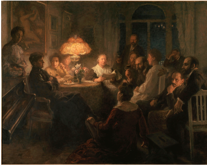
Figure 1. Hanna Pauli (1864–1940): Vännerna ('The Friends'), 1900–1907, oil on canvas, 204 x 260 cm, Nationalmuseum Stockholm, Public domain.