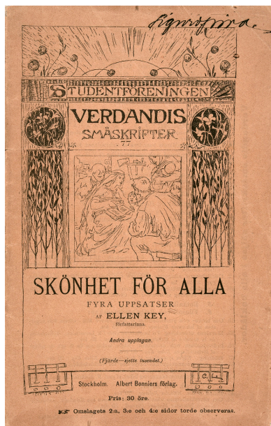
Figure 3. Ellen Key (1849–1926): Skönhet för Alla (‘Beauty for Everyone’), Stockholm 1899. Cover by Carl Larsson (1853–1919).

The great success of this exhibition—it was viewed by 5000 visitors—encouraged Ellen Key to extend and revise her essay “Skönhet i hemmen” (‘Beauty in the Home’) published in 1897, and together with the three magazine articles published in 1891–1897: “Vardagsskönhet” (‘Everyday Beauty’), “Festvanor” (‘Festive Customs’) and “Skymningsbrasan” (‘The Twilight Fire’) present a summary in the anthology Skönhet för Alla (‘Beauty for Everyone’) (Key 1891; Key 1895; Key 1896; Key 1897b). This appeared in 1899 with a title page designed by Carl Larsson in the series of the radical Uppsala Student Association Verdandi published by her friend Albert Bonnier (Key 1899; Figure 3).