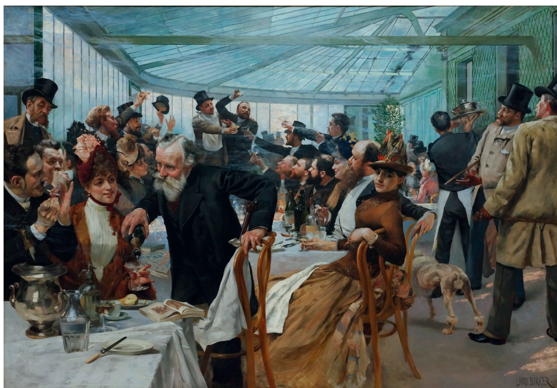
Figure 4. Hugo Birger (1854–1887): Skandinaviska konstnärernas frukost i Café Ledoyen, Paris fernissadagen 1886 ('Scandinavian Artists at Breakfast in Café Ledoyen on the day of the Paris Salon's opening in 1886'), 1886, oil on canvas, 183,5 x 261,5 cm, Göteborgs Konstmuseum, Public domain.