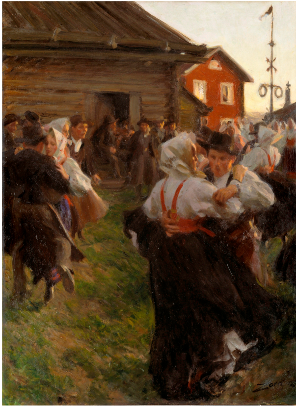
Figure 6. Anders Zorn (1860–1920): Midsommardans ('Midsummer Dance'), 1897, oil on canvas, 140 x 98 cm, Nationalmuseum Stockholm, Public domain.