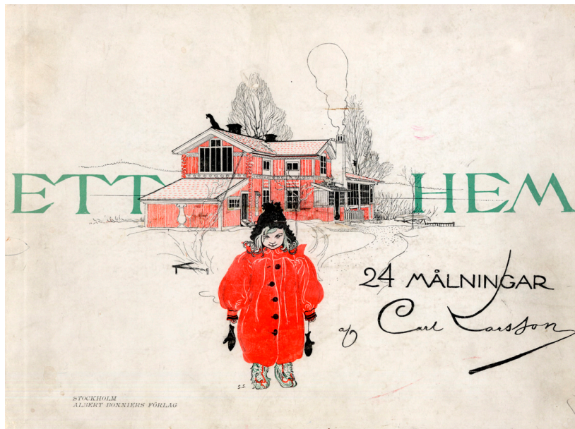
Figure 8. Carl Larsson (1853–1919): Ett hem ('A Home'), Stockholm, Albert Bonniers Forlag, 1899, cover.

In Sweden Ragnar Östberg (1866–1945), one of the country's leading architects, was among those to take up the ideas of Ellen Key and Carl Larsson. In 1906 he published his own booklet with the title Ett Hem ('A Home'), an introduction to the building and furnishing of artistically designed country cottages (Östberg 1906; cf. Sheffield 1997, pp. 41–43) (Figure 9). They also influenced, for instance, the Skønvirke movement in Denmark, which arose at the beginning of the 20th century around Caspar Leuning Borch (1853–1910), Anton Rosen (1859–1928) and P.V. [Peder Vilhelm] Jensen Klint (1853–1930), which was situated between Art Nouveau and National Romanticism and became institutionalised in 1914 with the publication of a periodical with the same title. Finally, Ellen Key and Carl Larsson communicated extensively with the national romantic circle of the polar explorer Fridtjof Nansen (1861–1930), the painter Gerhard Munthe (1849–1929) and the young architect Arnstein Arneberg (1882–1961) in Lysaker in Norway (Lane 2000, pp. 79–89).