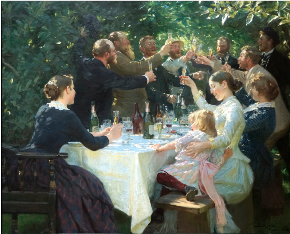
Figure 5. P.S. [Peder Severin] Krøyer (1851–1909): Hip, hip, hurra! Kunstnerfest på Skagen ('Hip, hip, hooray! Artists' Celebration in Skagen'), 1884–1888, oil on canvas, 134,5 x 165,5 cm, Göteborgs Konstmuseum, Public domain.

The subject of the rural holiday customs appeared and gained in importance in connection with the national romantic criticism of what was deemed to be the vulgar urban mass culture of the industrial age together with monarchist national rhetoric which was seen as obsolete. The farming class was regarded as the cradle of Nordic society and the preservation and artistic representation of traditional rural festive customs was seen as a contribution to cultural renewal. This renewal, however, had not only progressive but also conservative, even restorative features. To this it must be added that rural customs and traditions in the late 19th century in the Nordic countries just as in the countries of the European continent were on the retreat—as a result of rural depopulation, urbanization and industrialization (Häfner 1998, pp. 25–31; cf. Lane 2000, pp. 19–48).