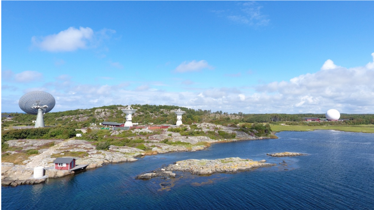
Fig. 3 The Onsala telescope cluster in 2016 with the new Onsala Twin Telescopes in the center of the photo. The new VGOS radio telescopes are equipped with reflectors of 13.2-m diameter. The radio telescope on the left hand side is the 25.6-m telescope installed in 1964, which is the first European telescope ever to be involved in VLBI. First geodetic VLBI measurements were performed already in 1968. The white radome on the right side of the picture houses the 20-m radio telescope installed in 1976, which was used with the Mark III geodetic VLBI system since 1979 and has the longest time series in the International VLBI Service for Geodesy and Astrometry (IVS) database. Close to the radome, but not visible in the photo, is the GNSS station ONSA, which was established already 1987 in the CIGNET network, several years before the International GNSS Service (IGS) was founded. ONSA had a pioneering role in the early days of GNSS, and has the longest continuous time series in the IGS network. There is also a gravimeter laboratory with a superconducting gravimeter. Shown in the picture foreground is the Onsala super tide gauge inaugurated in 2015. The observatory is one of the unique fundamental space geodetic sites that have a direct access to the sea level and co-locate VLBI, GNSS, gravimetry, and sea level monitoring. It is thus an important co-location site for the Global Geodetic Observing System (GGOS).