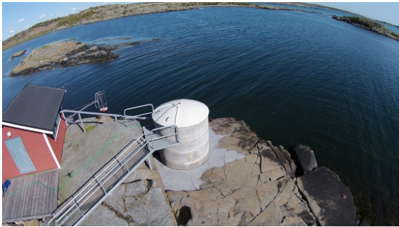
Fig. 2 The Onsala super tide gauge inaugurated in September 2015 and since then operated together with SMHI.

The GNSS-R based tide gauge was operated continuously and data were analyzed [1, 2]. The new (traditional) tide gauge station with a radar sensor and pressure sensors, inside and outside the well, was inaugurated officially in September 2015. It is now part of the national tide gauge monitoring network of the Swedish Meteorological and Hydrological Institute (SMHI).