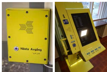
Fig. 1. Speaking machines that give spoken information on users' demand. The small device to the left and the large device to the right.

Observations were made during five hours at the central railway station in Gothenburg with the purpose to study passengers and visitors behaviour during different traffic announcements through the stations PA-system. Another purpose was to study the spoken information sources that the railway station provided, the so-called speaking machines as well as their placement and use. The speaking machines are boxes that give spoken information on the users' demand and exist as both small and large devices (Figure 1). Short questions were also asked to different travellers regarding the use and perception of the different sources of information.