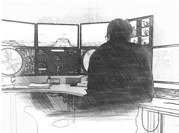
Fig. 2 Monitoring the students' actions from the instructors' room

When interactions between an instructor and students are taking place in the simulators, a variety of navigational technologies in a maritime context are essential as a basis for specific and timely instructions (Sellberg 2018; Sellberg and Lundin 2017a). For the instructor, being there in the midst of the action enables him or her to attend to specific details of the students' conduct, such as how they are managing their gaze and attention when integrating information from different sources on the bridge (Fig. 3). Similarly, in Sellberg and Lundin (2017b), the analysis shows how training coordination with other vessels in maritime traffic is sequentially organised in the simulator exercises, specifically focussing on the matter of temporality in instructional sequences. This means that assessments rely on the temporality of being either prospective or retrospective evaluations of the student's actions, because different temporalities offer different social and material conditions for their production. For example, when the assessment is targeting a manoeuvring action that is about to be carried out, the instructor must draw on his or her ability to evaluate how the situation will unfold over time, i.e. what is known as level three situation awareness (Endsley 1995). When the assessment is targeting a manoeuvring action that is already carried out, the instructor can rely on the historical traces that the TRAIL function leaves on the radar display as the basis for assessment.