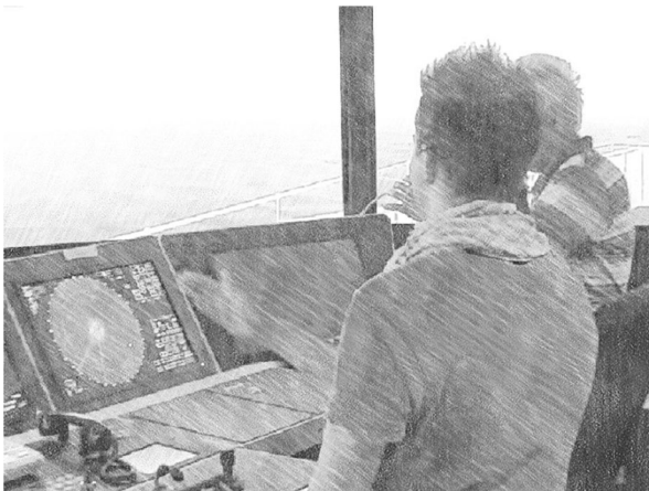
Fig. 5 Student and instructor collaboratively using their bodies to represent how a seagoing vessel would move during a turn

These instructions seem to have the potential to prevent the types of training pitfalls caused by a lack of simulator fidelity that Hontvedt (2015a) commented on and warned about. Addressing inconsistencies between the simulation and the work setting are opportunities for instruction and discussions that can further the students' understanding of the work practice for which they are training (cf. Hindmarsh et al. 2014; Rystedt and Sjöblom 2012). That, in turn, requires fastidious instructors who closely monitor the students' work, ready to support them through the exercises in the simulator. The results emphasise how the instructional support of an experienced seafarer connects the simulated event to the students' future work practice and emphasises the relevance of theoretical and abstract knowledge in simulation training.