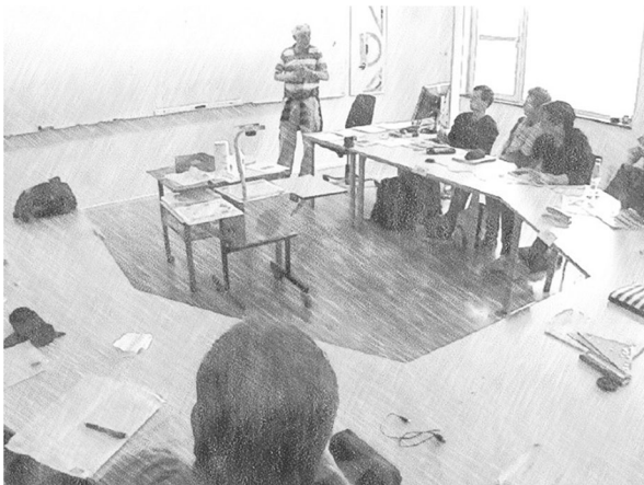
Fig. 1 The spatial layout of the briefing room

After the briefing, a scenario plays out in the simulator. In the scenarios chosen for further analysis, the exercises take place in the dense traffic of the Dover Strait and in