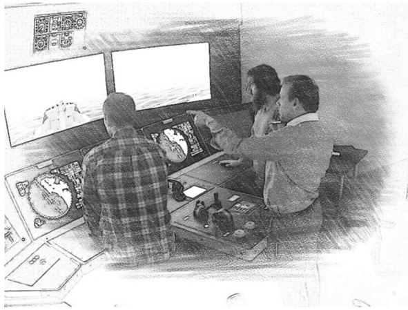
Fig. 3 A shared view of the situation enables specific details of the scenario to be highlighted and explained