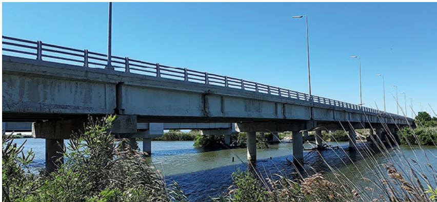
Figure 1. The Strimonas Bridge (Panetsos, 2017)

upon the piers, the deck of the bridge is simply supported through NB1 elastomeric bearings. Its expansion joints are elastomeric and of the T50 type. Finally, its identified components are the following: abutments, piers, superstructure, safety railings, sidewalks, pavement, and drainage system (Panetsos, 2017).