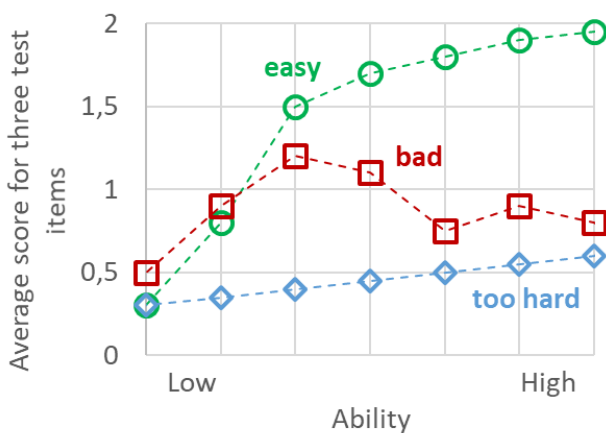
Fig. 1. Three illustrative Item Response Functions: the green circles represent an easy question (even rather low ability gives a high average score), the question with blue diamonds is too hard (giving poor discrimination for ability), and the bad red squares is for a question where higher ability does not result in a better score.

examined in an end-of-the-course written exam. The remaining credits are examined in project work and assignments during the quarter the course is running. The exam is divided into two parts – problems 3-5 rely on the students' access to and proficiency in using reference literature (the course text book) and often deal with data presented in graphs taken from recent research publications. Each of these problems can give up to 4 points. Problems 1-2 need to be solved with only paper and pencil. Problem 2 can give 2 points and is related to a particular sub-topic in the course which to a large extent concerns memorizing facts. Problem 1 contains five parts (a-e) where each part is a separate question which can give 2 points. The student must choose which four of these five parts she wants to address, making 8 the maximum score for problem 1. In order to pass, the student must have a total score of at least 9 on the exam, and at least 5 points must come from problem 1.