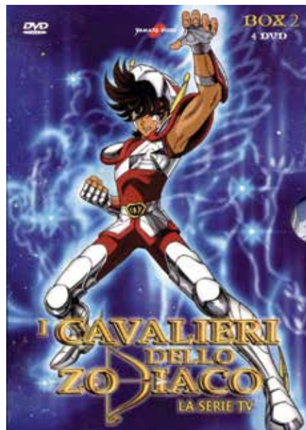
Figure 8. Cover of the Italian edition of the anime Saint Seiya , published by Yamato Video. Seiya is wearing his armour connected with the constellation of Pegasus, which is visible in the background. Credit: Masami Kurumada, Toei Animation

Sagittarius and the other constellations of the zodiac are featured in Saint Seiya by Masami Kurumada (Figure 8). Five of the main characters in Saint Seiya are a group of knights (called “Saints”), valiant warriors who are faithful to the goddess Athena, protector of humanity. They fight against the dark forces that threaten Earth. Each character is linked to a constellation of the boreal or austral sky through the armour that they wear. The knights who wear armour representing zodiacal signs are the most powerful, although some of them are corrupt. The main heroes wear the less-powerful armour of the constellations Cygnus, Andromeda, Draco, Phoenix and Pegasus, and the plot follows their quest in fighting villain knights and becoming more powerful. Their fighting techniques are in some cases connected to the mythological and astronomical objects in these constellations. One example is that of the Andromeda knight. His armour has a chain that during the fight, may be disposed around the hero in a spiral shape resembling that of the Andromeda galaxy. Saint Seiya also has ties to Chinese traditions and Taoism. For example, heroes fight evil by widening their perceptions through the use of “the cosmos”, a seventh sense that enables them to gain knowledge of their own possibilities and to increase their strength. Using this comic, we can illustrate some peculiarities about these constellations.