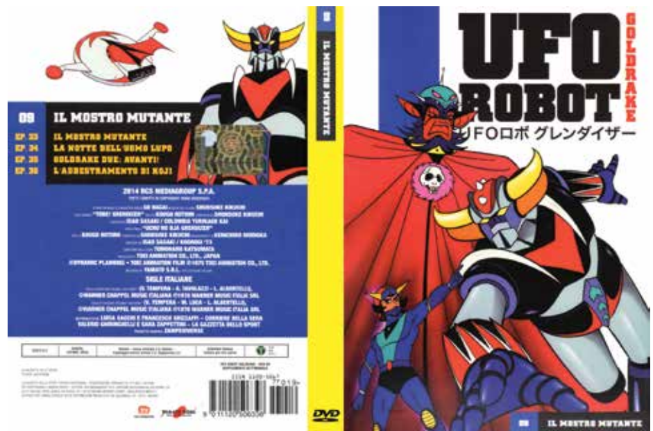
Figure 7. Cover of the Italian edition of the anime UFO Robot Grendizer published by Yamato Video. The powerful robot Grendizer, Koji Kabuto and the evil King Vega are depicted in the cover. Credit: Go Nagai, Toei Animation

There are countless astronomy-related curiosities about this saga. For instance, Vega is of great importance in astronomy since it has long been used to calibrate observational instruments and as a reference for measuring the magnitude of stars. It is used as the zero point of the Johnson-Morgan photometric system. In the Grendizer saga, Duke Fleed's native planet belongs to the Vega system; we start from this to describe the elements that have been observed in this system to suggest the presence of a planetary system around Vega. One of these elements is a disc of dust, extending around 100 au, very similar to what is expected from an equivalent of a Kuiper belt (Su et al., 2005). Further investigations have shown the presence of condensations of material in the disc. This fact has led some researchers to assume the presence of giant planets, probably similar to Jupiter or Neptune, although they have not yet been directly observed and their presence is currently regarded as unlikely, at least in the inner few au of the system (Wilner et al., 2002; Piétu et al., 2011; Mennesson et al., 2011).