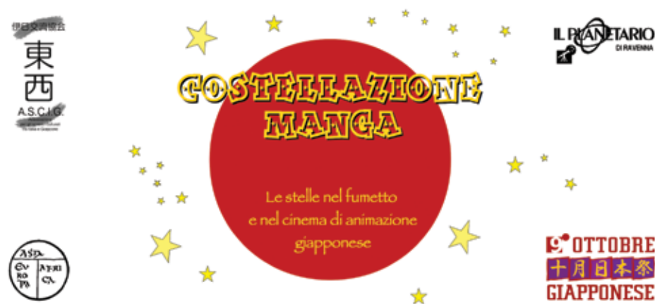
Figure 1. Front of the flyer for the first edition of Costellazione Manga , held in 2011 in Ravenna, Italy. The subtitle may be translated as “Stars in Japanese comics and animation”.

answers, thereby connecting the pleasure of reading science fiction to the process of discovery. In the following sections, we describe some of the pedagogical premises on which our project is based.