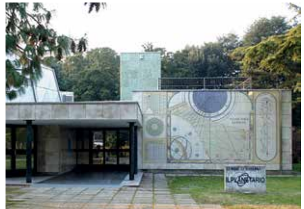
Figure 2. The Planetarium of Ravenna, Italy, in 2017. Left panel: The Zeiss analogue planetarium inside its dome. Right panel: Entrance to the planetarium building, showing the dome and the sundial panel.

several parts of the starry sky visible at that time of the year and connected to specific anime or manga. The maximum duration of a show is 60 minutes, so we typically touch on three anime/manga. Since these comics are so popular, the audience immediately recognises them and we need only a few minutes to describe the parts of the plot with astronomy-related references. Finally, we summarise what we have talked about and then leave time for questions.