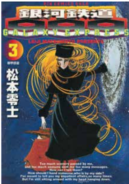
Figure 3. The cover of the Japanese edition of Galaxy Express 999, by Leiji Matsumoto. We see the two protagonists and Andromeda galaxy, the final destination of the fictional train.