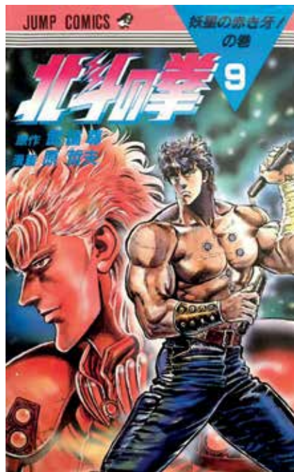
Figure 5. The cover of the Japanese manga Hokuto no Ken , by Buronson and T. Hara. The scars shaped as the seven stars of Hokuto are visible on Ken's chest. Credit: Buronson-Hara

The purpose of the Hokuto school of martial arts is to guarantee peace, and Ken