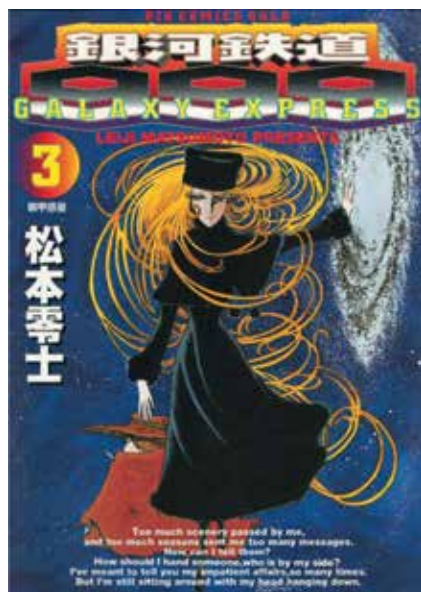
Figure 3. The cover of the Japanese edition of Galaxy Express 999, by Leiji Matsumoto. We see the two protagonists and Andromeda galaxy, the final destination of the fictional train.