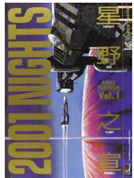
Figure 4. Cover of the Italian edition of 2001 Nights by Yukinobu Hoshino, published by Flashbook. A hard science fiction work describing the human venture of exploring space. Credit: Y. Hoshino

We are still in the early phase of space exploration, which is mostly conducted using robotic probes. In the show, we use the example of the Voyager 1 probe to show how difficult it is to programme a space mission and how long a satellite has to travel to reach other planets or the edge of our Solar System. Indeed, at several times during the last decade, we have had updates on the status of the Voyager 1 probe, which is thought to have reached the heliopause (the point where the solar wind meets the interstellar medium). Forty years since its launch, it has travelled 120 au 4 , making it the human-made object that has gone the farthest from Earth; it has gone beyond the heliosphere and is now travelling towards the Oort Cloud. However, for it to exit the Solar System, it has to travel another 100 000 au, which will take more than 30 000 years 5 . This probe is also