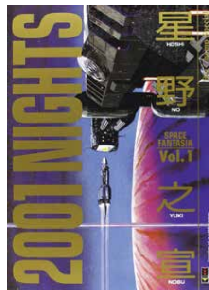
Figure 4. Cover of the Italian edition of 2001 Nights by Yukinobu Hoshino, published by Flashbook. A hard science fiction work describing the human venture of exploring space. Credit: Y. Hoshino

We are still in the early phase of space exploration, which is mostly conducted using robotic probes. In the show, we use the example of the Voyager 1 probe to show how difficult it is to programme a space mission and how long a satellite has to travel to reach other planets or the edge of our Solar System. Indeed, at several times during the last decade, we have had updates on the status of the Voyager 1 probe, which is thought to have reached the heliopause (the point where the solar wind meets the interstellar medium). Forty years since its launch, it has travelled 120 au 4 , making it the human-made object that has gone the farthest from Earth; it has gone beyond the heliosphere and is now travelling towards the Oort Cloud. However, for it to exit the Solar System, it has to travel another 100 000 au, which will take more than 30 000 years 5 . This probe is also