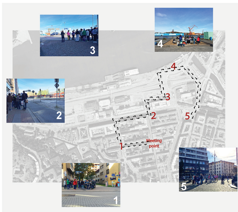
Figure 2. Soundwalk map: sites.

1 Urban transformation: sites are part of the new development strategy of Gothenburg city [80]. High noise levels: environmental outdoor noise levels for L_{den} (day-evening-night noise level) above 55 dB and above 50 dB for L_{night} (night noise level) [82]. Popular place: well-known spaces used by citizens and tourists.