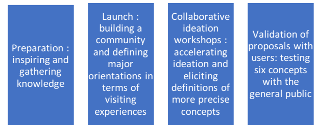
Fig. 1. The four steps of reinventing a museum

To investigate how experimenting with collaborative processes can contribute to reinventing an organization's purpose and practices, we conducted 12 semi-structured interviews with employees and management of the Insectarium as well as external participants, after the collaborative process was completed. We asked questions regarding the way the interviewees experienced the project, regarding the way the museum functioned prior to the project and regarding current practices within the museum. Each interview lasted between 60-90 minutes. Appendix A outlines key themes and questions addressed in the interviews. To complement the interview data and to further inform our analysis, we also had access to the multi-media archives of this 2-year process, documenting the different steps taken, as well as all the power-point presentations that the head of the museum made in order to present the project and how she saw her role in it.