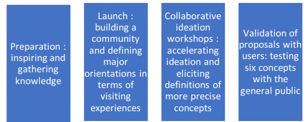
Fig. 1. The four steps of reinventing a museum

To investigate how experimenting with collaborative processes can contribute to reinventing an organization's purpose and practices, we conducted 12 semi-structured interviews with employees and management of the Insectarium as well as external participants, after the collaborative process was completed. We asked questions regarding the way the interviewees experienced the project, regarding the way the museum functioned prior to the project and regarding current practices within the museum. Each interview lasted between 60-90 minutes. Appendix A outlines key themes and questions addressed in the interviews. To complement the interview data and to further inform our analysis, we also had access to the multi-media archives of this 2-year process, documenting the different steps taken, as well as all the power-point presentations that the head of the museum made in order to present the project and how she saw her role in it.