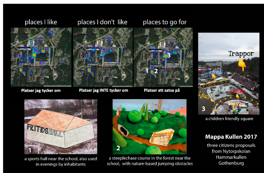
Figure 2. The results of pupil's choice.

Based on that information, the pupils were tasked with proposing something for a place about which many opinions were given. They went to the three sites selected by most people, documented them with photos, and discussed them. In collaboration with their art teacher, they then designed something that would solve the problems noted, but without destroying the positive qualities mentioned about the same place. Thus, they worked in an interdisciplinary manner, involving several core subject teachers. The results were design proposals for: (1) a sports hall near the school, also used in evenings by inhabitants; (2) a steeplechase course in the forest near the school, with nature-based jumping obstacles; and (3) a child-friendly square (See Figure 2).