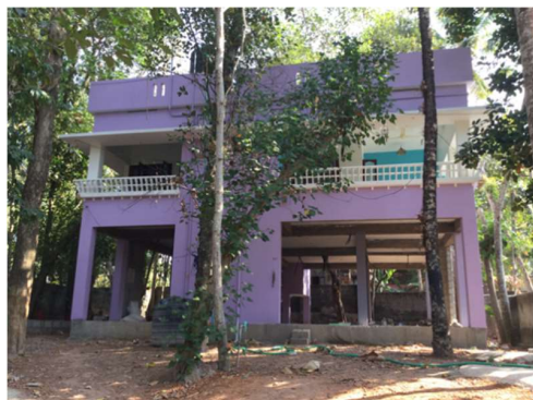
(a) “The possibility of working from anywhere—even from our family house in India” (P2-M1)

take advantage of a more expanded idea of the workplace in the future; for example, as described in Figure 5a: “We will use nature more as a room to work. We should create more flexibility, and work in the car, or in the parks, seeing the workplace as ever changing” (P4-M1).