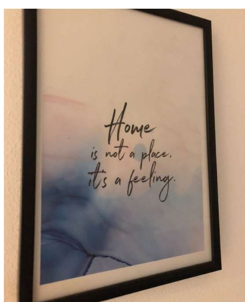
(a) “We have to strengthen the team and the ‘we feeling’ of shared culture and purpose” (P9-M1)