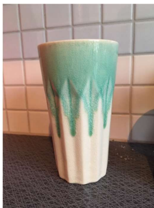
(a) “Something has been lost—my favourite cup has been lonely” (P7-M1)