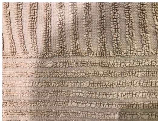
(b) “Everything goes in straight lines in online meetings, one always takes the fastest way, so we lose the nuance and simplify complex issues” (P6-M1)