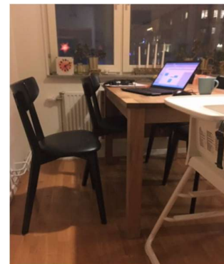
(b) “Ergonomic challenges with the home office” (P2-M1)