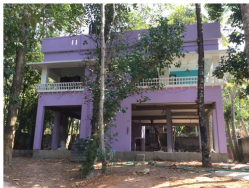
(a) “The possibility of working from anywhere—even from our family house in India” (P2-M1)

take advantage of a more expanded idea of the workplace in the future; for example, as described in Figure 5a: “We will use nature more as a room to work. We should create more flexibility, and work in the car, or in the parks, seeing the workplace as ever changing” (P4-M1).