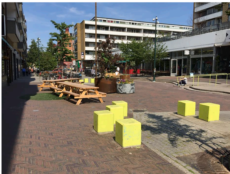
Fig. 2. Cleasgatan photo taken by Vogel, 2019.