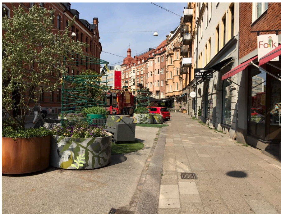
Fig. 1. Friisgatan photo taken by Vogel, 2019.