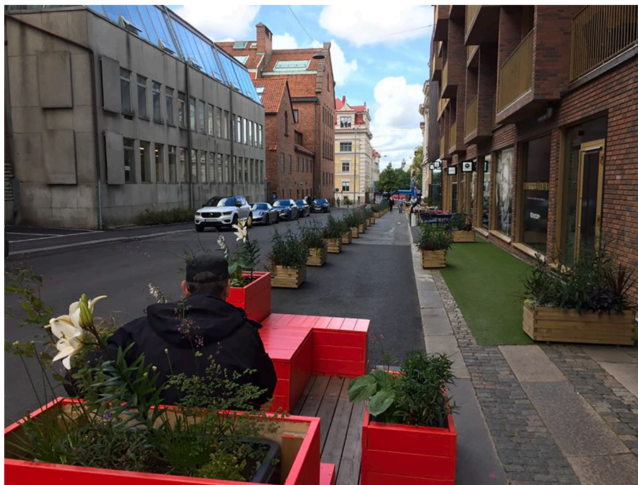
Fig. 4. Teatergatan photo taken by Vogel, 2019.

remaining 65% live within the same neighbourhood (i.e. city blocks within the nearest main street). More than half of the residents participating in the study did not have any children (62%). Moreover, users of place, such as pedestrians and bikers, were also included in the study ( N = 90 ) (Malmö N = 39 , Gothenburg N = 51 ).