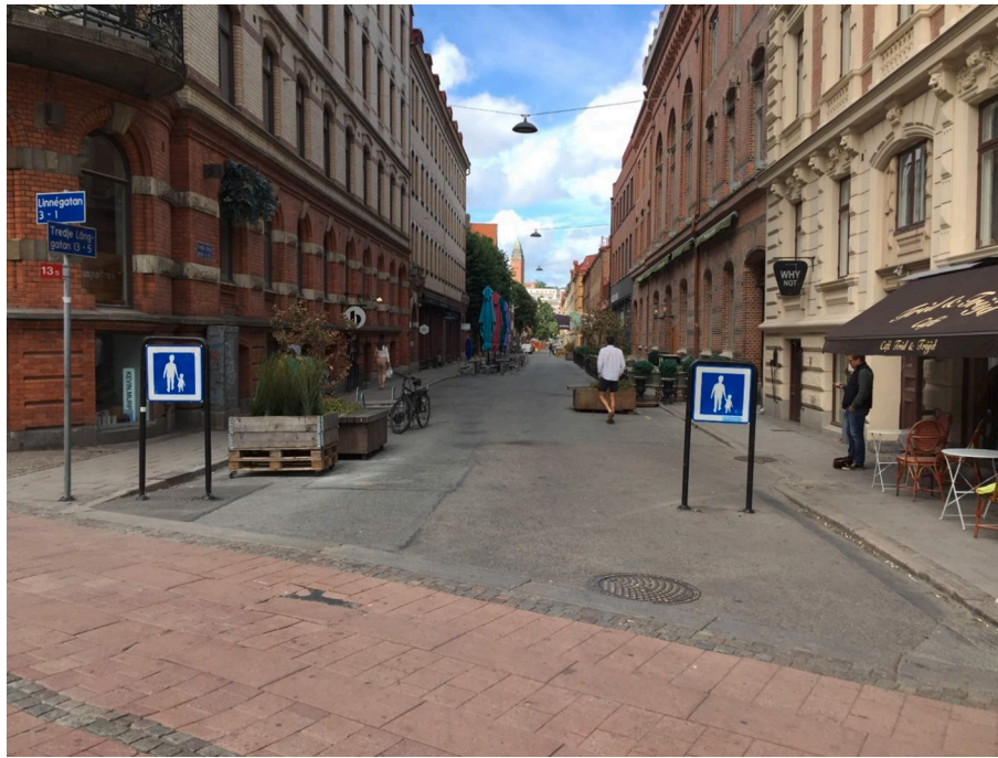
Fig. 3. Tredje Långgatan photo taken by Vogel, 2019.