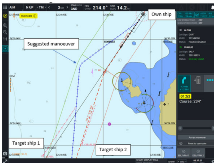
Figure 1. AIM user interface.