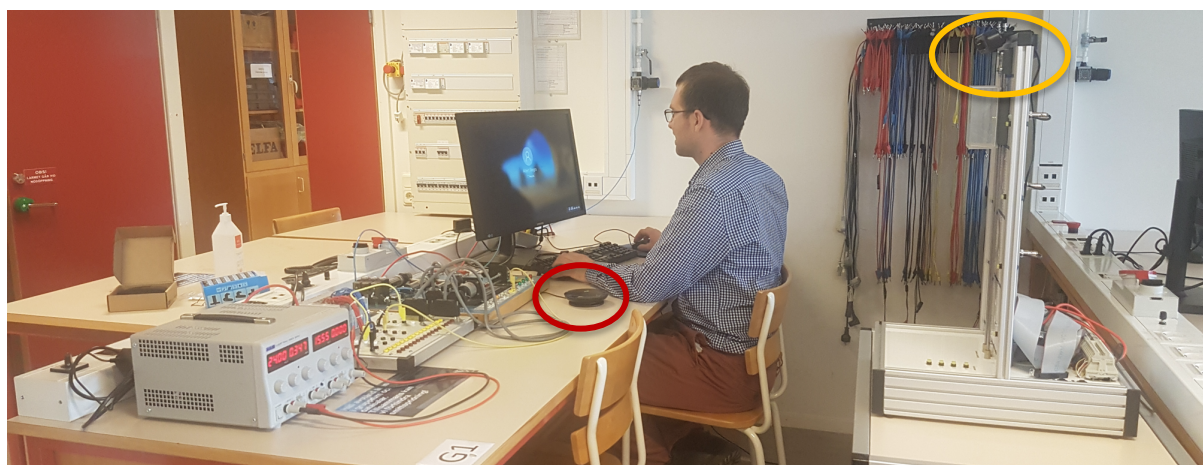
Figure 1. Lab setup for lab session with one student on campus and one student online in hybrid format. The web camera is marked in yellow, and the conference mic is marked in red.

The hybrid learning set-ups were guided by the pandemic restrictions, i.e., the maximum students in rooms, and the need for students to stay at home when experiencing symptoms. In the hybrid format it was possible for both students in a pair to be on campus for the labs, and it was possible for one student to be on campus and the other student to be online and work together. An example of the setup for one student online is seen in Figure 1. The setup facilitated one web camera (encircled in yellow) and one conference mic (encircled in red). The students were communicating online through Zoom, where the student in the lab could share the screen and give control to the other student. Through the conference microphone, the teacher could talk to and discuss with both students at the same time, as if they were both in the lab.