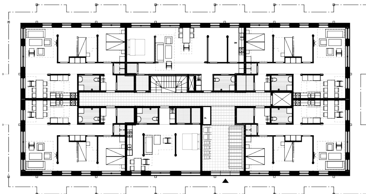
Ground floor in one of the building types. Design team: Spridd, Nivå Landskap, Incoord, and Kvarnstadén.