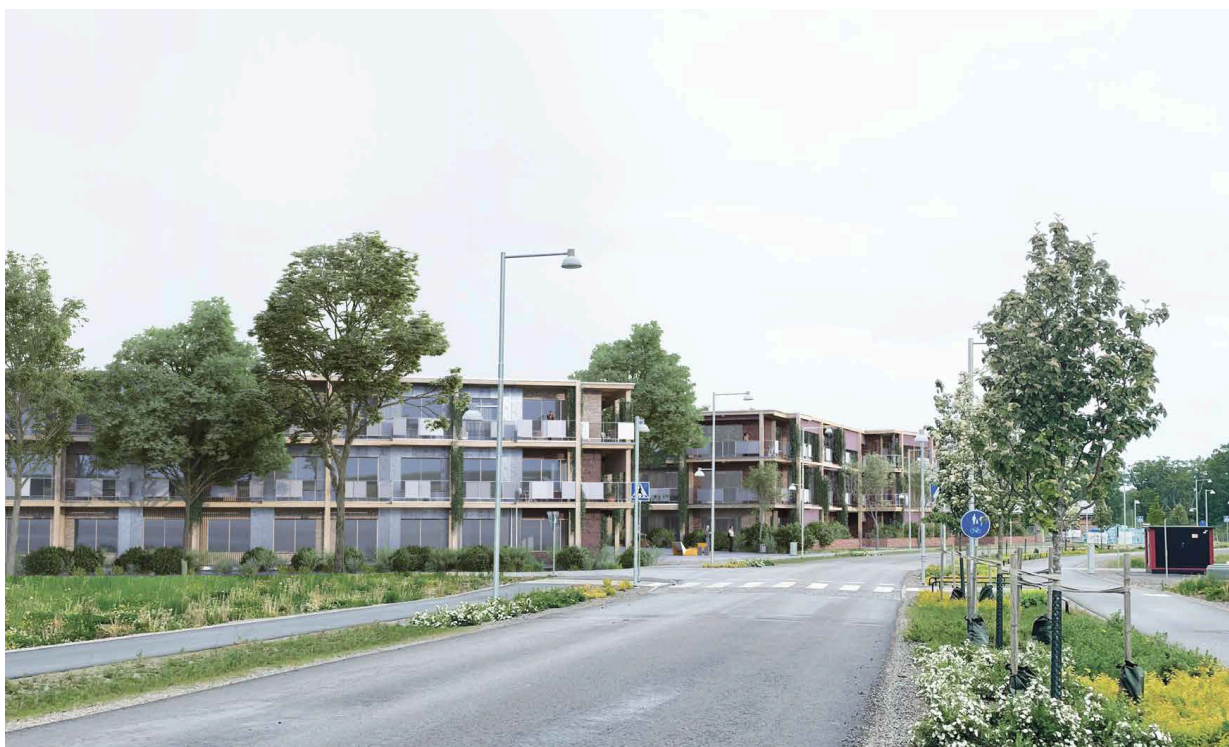
View along the main street in the area. The façade is designed as a framework filled with recycled materials. Design team: Spridd, Nivå Landskap, Incoord, and Kvarnstadén.