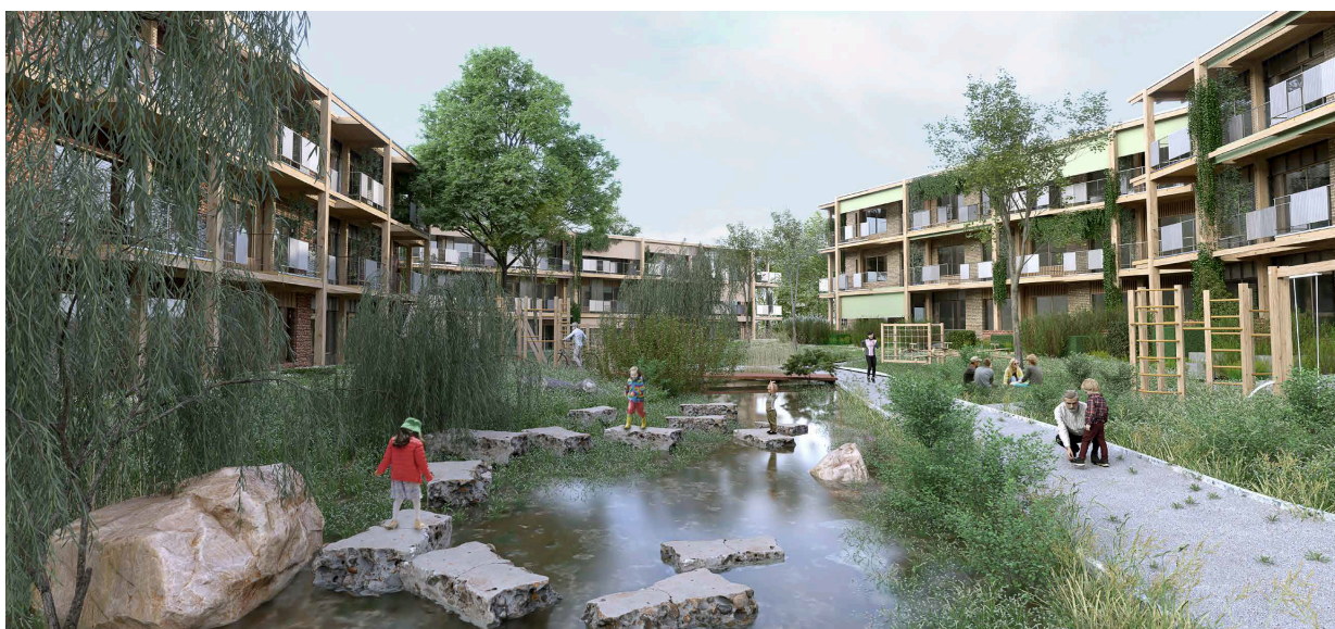
View of the outdoor environment with stormwater detention system. Design team: Spridd, Nivå Landskap, Incoord, and Kvarnstadén.