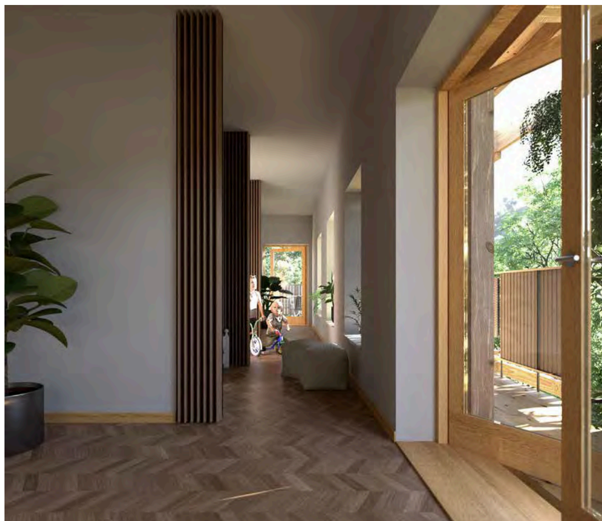
View through apartment along the facade. Design team: Spridd, Nivå Landskap, Incoord, and Kvarnstadén.