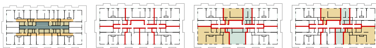
Plans over one of the residential buildings showing design principles behind flexibility and alterations of apartments in the proposal. Design team: Spridd, Nivå Landskap, Incoord, and Kvarnstadén.