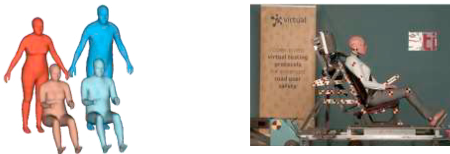
Fig. 1. The VIVA+ 50F and 50 M as seated and standing models (left) and the SET v0.1 50F (right).

The SET models are based on the design concept of the BioRID, which has been further developed, as well as the body geometry, height, and weight of the VIVA+ models. The spine of the SET is, in addition to the sagittal plane motion of the BioRID, able to rotate along the vertical axis. Furthermore, the SET has a newly designed flexible shoulder segment. The first version, SET v0.1 has been constructed, the VIVA+ 50F and 50 M and the SET v0.1 50F are shown in Fig. 1.