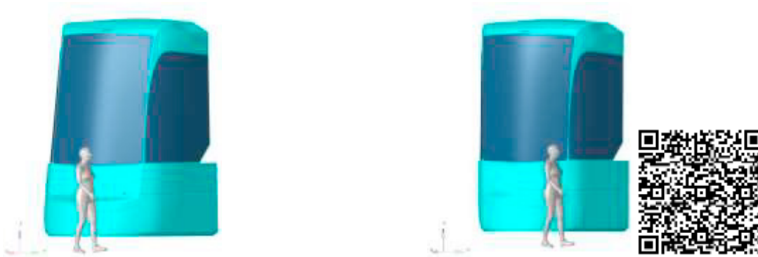
Fig. 3. Generic tram model in compliance with TR17420 with VIVA+ 50F at 15% tram width (left) and steeper front shape at 50% tram width (right) and the QR code of Siemens "Assisted and Driverless Train Operation".

Table 2 and Table 3 exemplarily show tram pedestrian impact simulation results for differently shaped tram fronts. From the HIC values alone almost no head injury would be expected. This is mostly due to the front screen that is geometrically set back and therefore almost prevents direct head impact onto the glass (at least in the 50F case considered here).