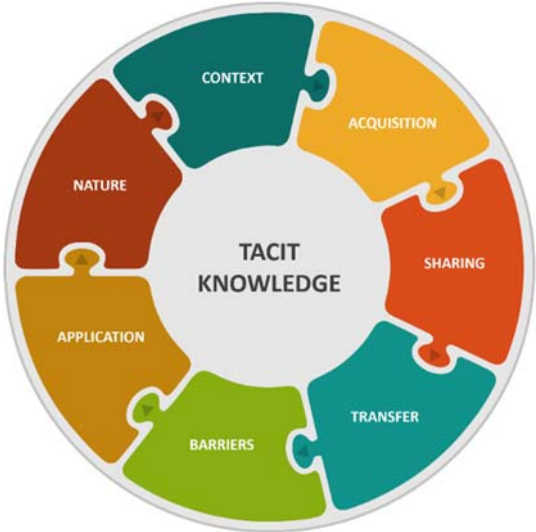
Figure 4. The framework used to delineate and define tacit knowledge, as presented in Section 5.3.

Given the inherent difficulties in delineating and defining tacit knowledge, it may be more advantageous to conceptualize it as a framework rather than as a singular concept. A framework (Figure 4 and Table 2), drawing on findings from Creswell (2014) and Patton (2002), was therefore developed and applied to address tacit knowledge in terms of its nature (Polanyi, 1966), context (Spender, 1996), acquisition (Kolb, 1984; Nonaka & Takeuchi, 1995), sharing (Leonard & Sensiper, 1998), transfer (Nonaka & Takeuchi, 1995; Collins, 2010), barriers (Boh, 2007; Gourlay, 2016), and application (Sensiper, 1998; Sternberg & Horvath, 1999). This framework captures and highlights the essential characteristics of tacit knowledge, facilitating the development of a more precise and functional definition.