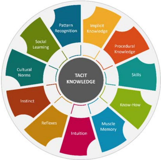
Figure 3. Tacit knowledge and related topics from Sections 5.2.1–5.2.11.

Based on the taxonomy of tacit knowledge presented in Section 5.2.1–5.2.11, it is evident that tacit knowledge is a complex phenomenon, closely interconnected with various related concepts (Figure 3 and Table 1). This complexity often leads to overlaps in meaning, prerequisites, and outcomes, making both general understanding and operationalization challenging.