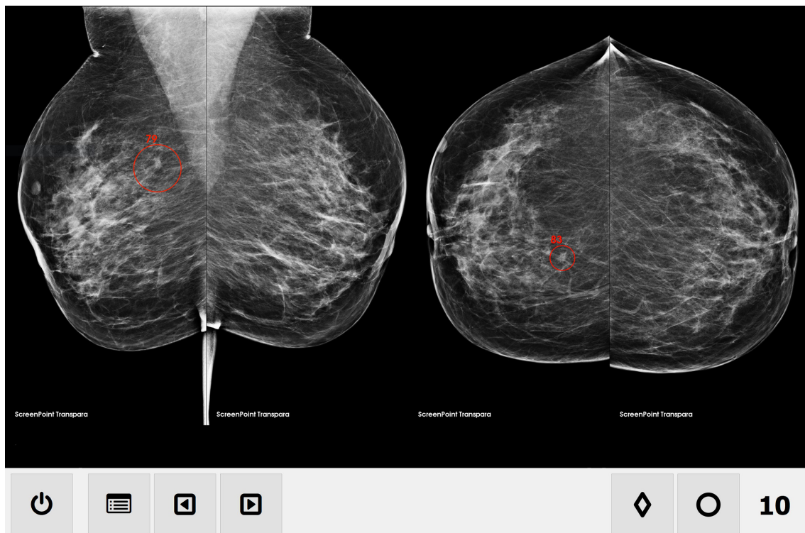
Figure 1. Transpara mammogram overview, MLO (left) projection and CC (right) projection. The overall malignancy risk score (in this case, 10) is indicated in the lower right-hand corner. Lesions are delineated with a red circle and assigned a risk score. In this case, a lesion in the right breast is given a risk score of 79% in the MLO image projection and 83% in the CC image projection. CC, craniocaudal; MLO, mediolateral-oblique.