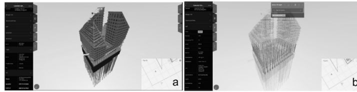
Figure 1: a: StreamBIM screenshot of Case project, Kaj 16. b: Filtering of the BIM use classification system.

study tested using two different methods for performing a cost estimation. The first method used BIM viewer and collaboration software, StreamBIM's own export and data structure to calculate quantities.