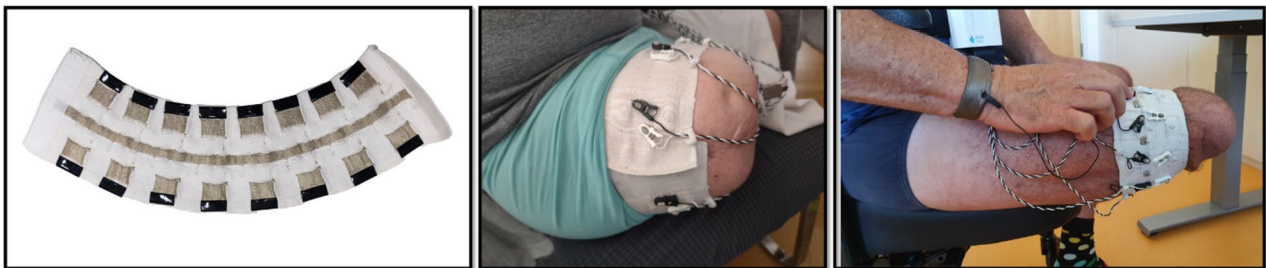
Fig. 1 Textrode-band (left) and participants wearing the Textrode-band (middle and right): the middle panel demonstrates application on a shorter residual limb, whereas the right panel illustrates usage on a longer residual limb

Each training session followed a structured sequence: (1) a self-assessment of pain, (2) placement of the electrodes, in this study, the Textrode-band, (3) real-time verification of myoelectric signals, (4) recording of myoelectric signals from the residual limb muscles through a series of standard/prescribed limb movements (e.g., knee flexion/extension) to train the system in identifying motor intentions, and (5) practice of motor execution in: VR or AR (a) gaming: controlling a virtual racing car or break-out bar from intended phantom limb movements