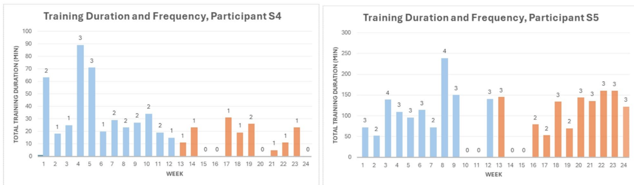
Fig. 3 The participation patterns of S4 and S5 during IP I (blue) and IP II (orange): the bars represent the total weekly training duration, and the number on top of each bar represents the number of training sessions the participant completed in the corresponding week

bath at night, and then I can practice my hands [with the Textrode-band system].” (S5). Another participant created a routine that fit their schedule, explaining, “I made it part of my weekly routine, like people going to church on Sundays. I dedicated that time to myself—for my mind and body—taking the weekend to focus without feeling rushed.” (S4).